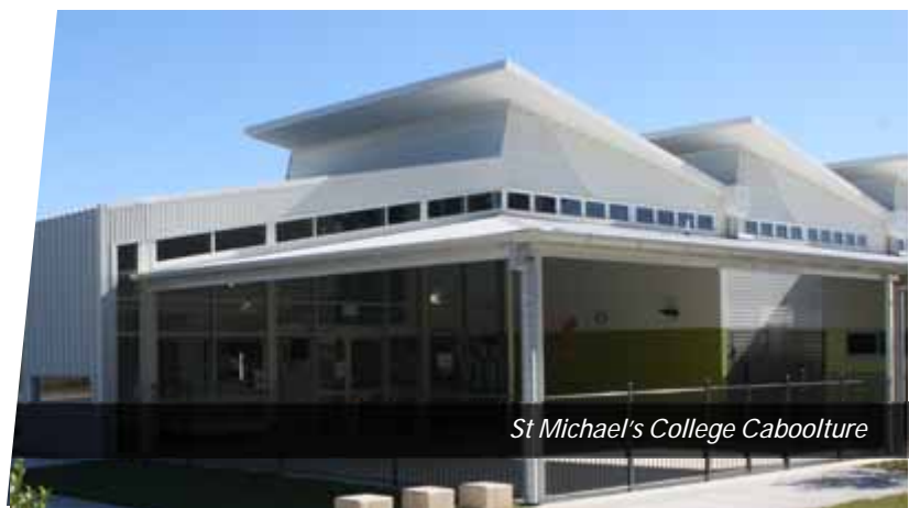
St Michael's College Caboolture