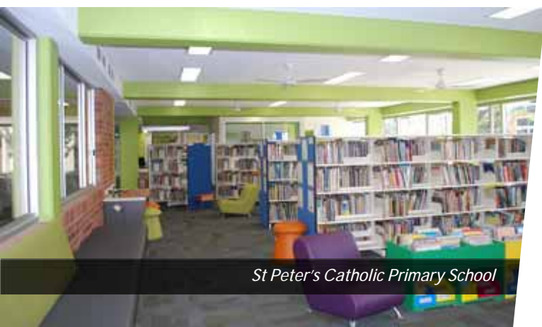
St Peter's Catholic Primary School